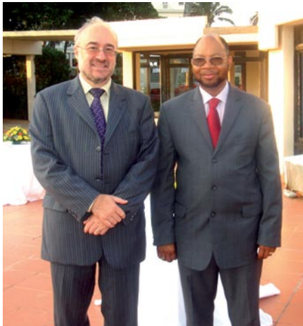
Maputo, Mozambique, October 2006 — Mr Jarraud with Mr António Francisco Munguambe, Minister of Transport and Communications

to reinforce the proposed African Monitoring of the Environment for Sustainable Development (AMESD) project. The Forum also recognized the important roles of WMO and the NMHSs in the implementation of AMESD, and made recommendations for their enhanced involvement in the project.