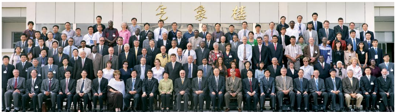
Nanjing, China, September 2006 — Participants in the Tenth WMO Symposium on Education and Training

Attending the event were HE Ms Maria Mutagamba, Minister for Water and Environment of Uganda and Chairperson of the African Ministers' Council on Water; HE Ambassador Filipe Chidumo, Permanent Representative of Mozambique to the United Nations; Mr Oussou Edouard Aho-Glele, Minister Counsellor of