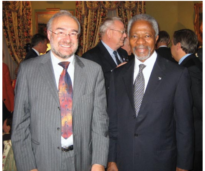
New York, 27 October 2006 — The Secretary-General of WMO with the Secretary-General of the United Nations, Kofi Annan, on the occasion of the second regular session of the United Nations System Chief Executives' Board for Coordination

Coordination (CEB), which was chaired by the UN Secretary-General and held at UN headquarters in New York. The session addressed a number of high-priority programme and management issues, including employment and migration, the Least-Developed Countries (LDCs), relations with parliamentarians, gender mainstreaming, the UN System Staff College and results-based management. Following the session, a CEB retreat took place at Greentree Estate in Manhasset (New York), during which UN Executive Heads had discussions on system-wide coherence and reform issues.