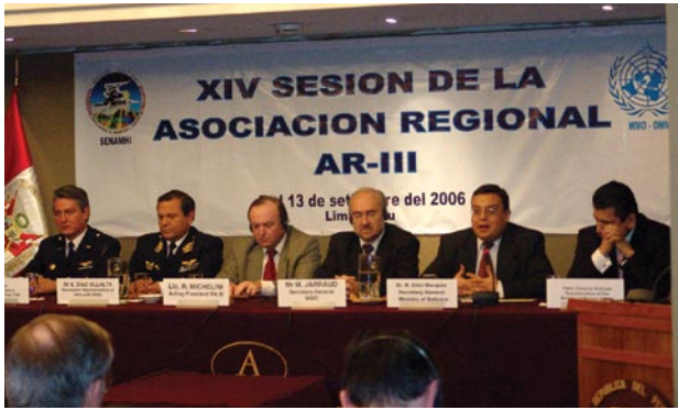
Lima, Peru, 7 September 2006 — Opening ceremony of the 14th session of RA III