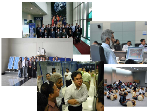
Fig 3. Various activities of “Advanced Analysis of COMS” in 2009

This training has been supported by the Korea International Cooperation Agency (KOICA), and 23 participants from 13 countries will participate this year’s session. The training materials will be shared via NMSC homepage by the end of this year.