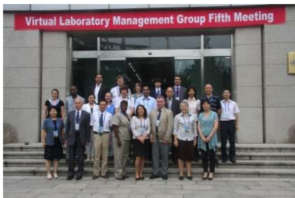
Fig 1. VLMG-5 participants

One of the main issue of VLMG-5 was about 'Using ESRC as the VLab Resources Library'. The VLab members have discussed on establishing a method of sharing the on-line training resources from a web page, and ESRC was proposed as a promising candidate. And the relationship between VLab and WMO Doc 258 on Education and Training was also discussed in many way, especially regarding the Basic Instruction Package for Meteorologist and Qualification Management.