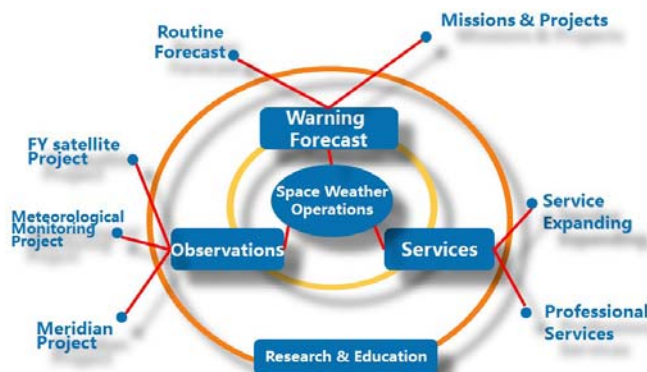
Figure 2: Flowchart of Space Weather Operation

The space weather operation has achieved international and domestic recognition and support. It not only becomes an important force in the national space weather community but also plays an important role on the international cooperation (Figure 2).