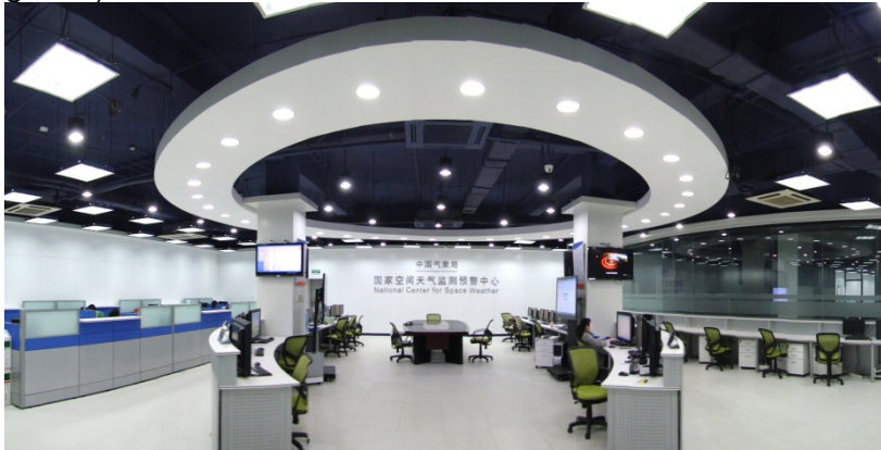
Figure 1: Forecast Portal of National Center for Space Weather

The national space weather operation system, including monitoring, forecasting and services, has basically been completed after more than ten years of construction and development (Figure 1).