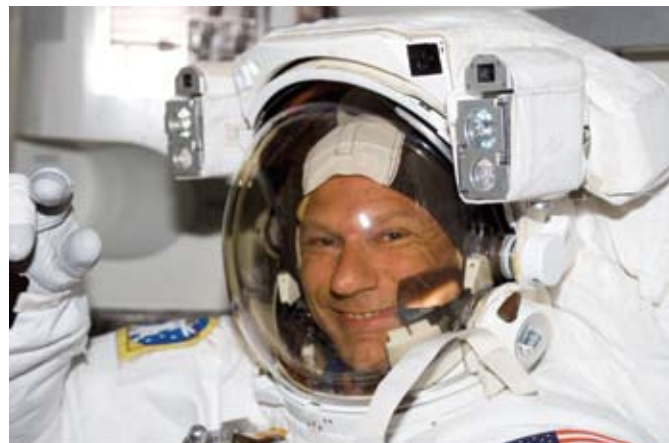
Astronaut Piers Sellers waves to the camera in the Quest Airlock of the International Space Station prior to the start of the first scheduled session of extravehicular activity

'Working in WCRP GEWEX was a very busy and rewarding time'